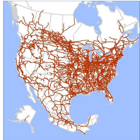
North America's Freight Rail Network

Meanwhile, rail intermodal — the transport of shipping containers and truck trailers on railroad flatcars — has grown tremendously over the past 30 years. Today, just about everything found on a retailer's shelves may have traveled on an intermodal train. Large amounts of industrial goods, such as auto parts, are transported by intermodal trains as well.