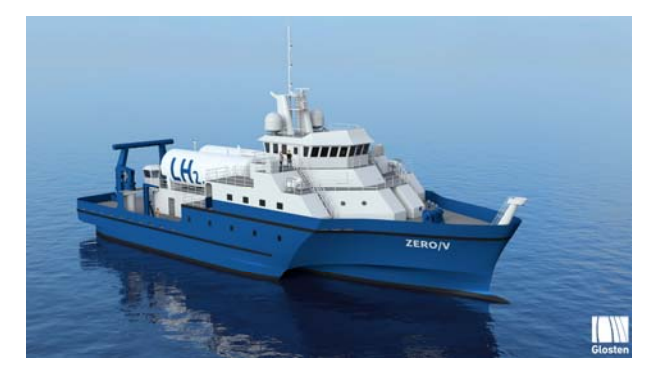
Figure 2 Zero-V Research Vessel

As part of a MARAD funded project, Glosten worked with partners Sandia National Laboratories and Scripps Institution of Oceanography to design a