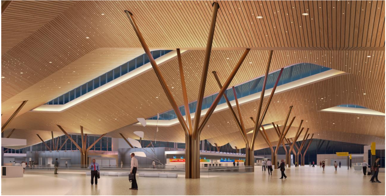
Wood paneling in our new terminal

Pittsburgh International Airport Landside Terminal, 4th Floor Mezz. PO Box 12370 | Pittsburgh, PA 15231-0370 (412)472-3500 | FLYPITTSBURGH.COM