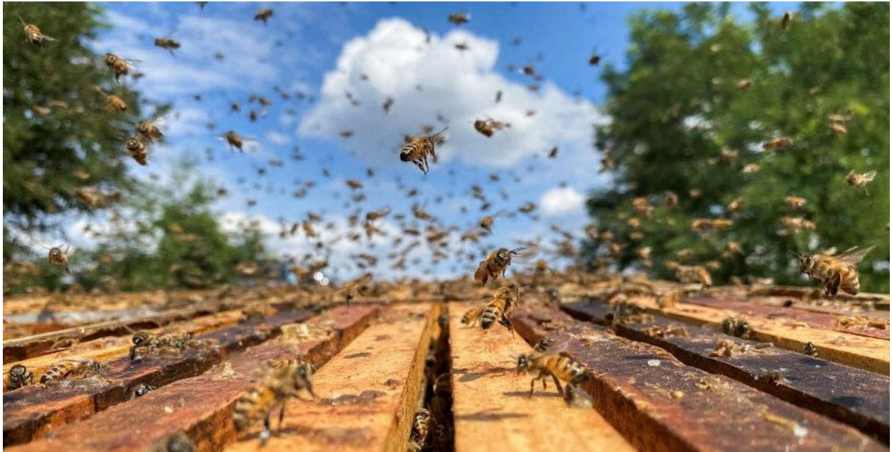
Bees at our apiary

Pittsburgh International Airport Landside Terminal, 4th Floor Mezz. PO Box 12370 | Pittsburgh, PA 15231-0370 (412)472-3500 | FLYPITTSBURGH.COM