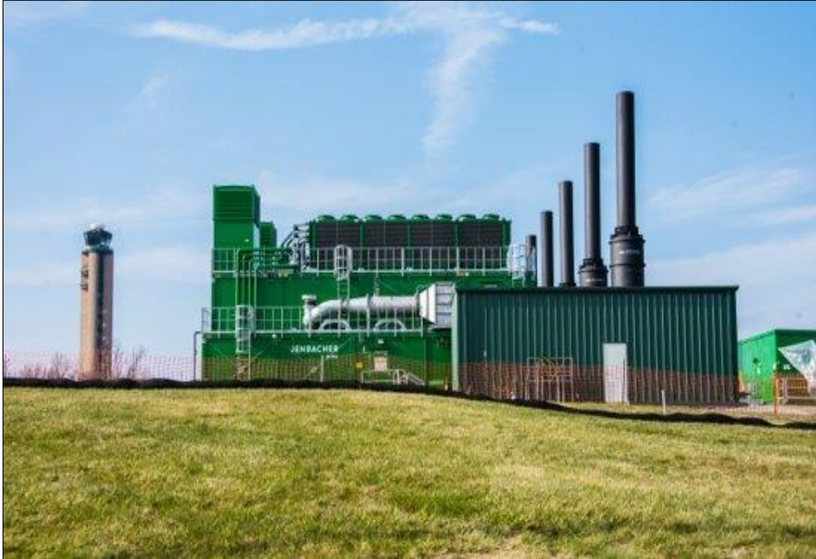
Pittsburgh International Airport Microgrid