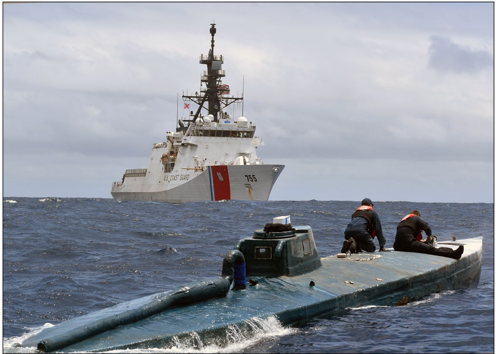
Figure 1: Coast Guard Personnel Conducting Drug Interdiction Operation

GAO-24-107144