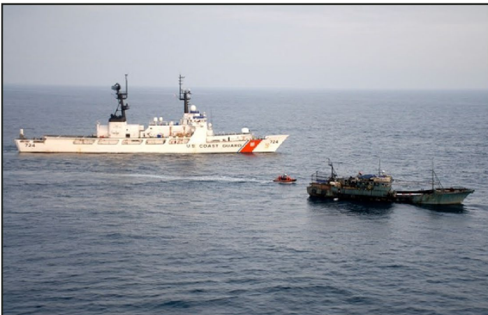
Figure 3: Coast Guard Vessel Interdicting Illegal Fishing and Officials Preparing to Conduct a Law Enforcement Boarding

plastics and other marine debris. IUU fishing encompasses many illicit activities, including under-reporting the number of fish caught and using prohibited fishing gear. In fiscal year 2022, the Coast Guard boarded 81 foreign vessels to suppress IUU fishing, according to the Coast Guard's fiscal year 2024 posture statement. Figure 3 below shows a Coast Guard vessel interdicting a vessel using an illegal high seas driftnet, and Coast Guard officials preparing to conduct a law enforcement boarding. According to the Coast Guard IUU Strategic Outlook, IUU fishing has replaced piracy as the leading global maritime security threat that if unchecked could threaten geo-political stability around the world. 7