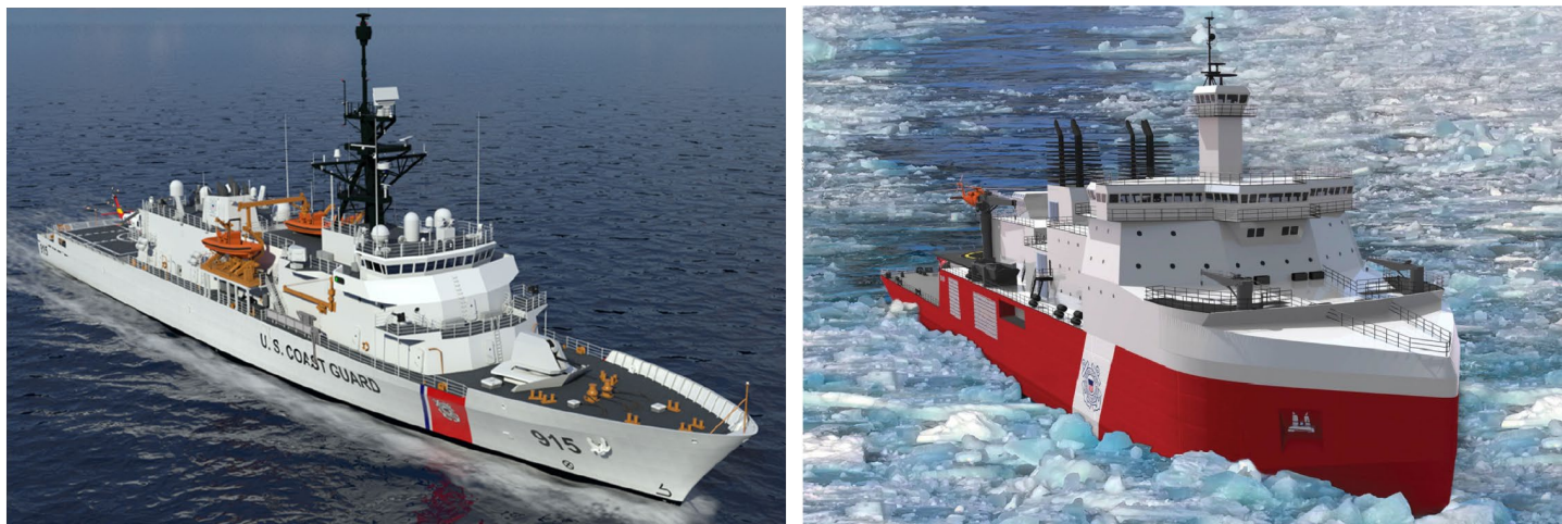
Figure 5: Rendering of the Coast Guard’s Offshore Patrol Cutter (left) and Polar Security Cutter (right)

Source: 2016 Eastern Shipbuilding Group, Panama City, Florida (left image); Bollinger Mississippi Shipbuilding (right image). | GAO-24-107144