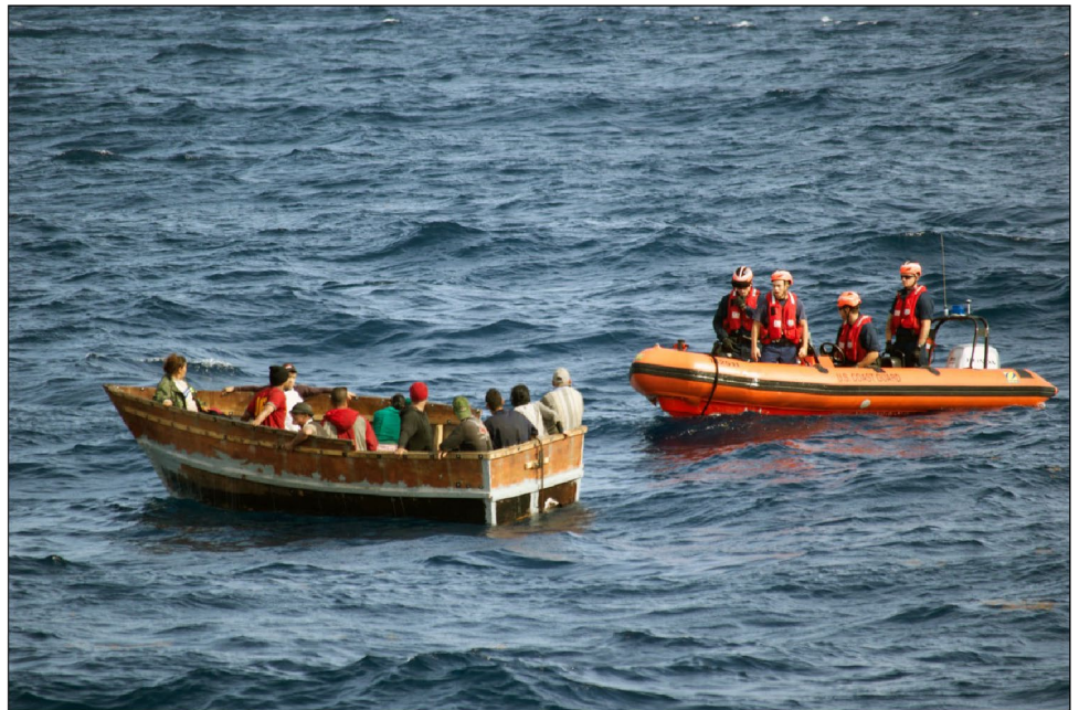
Figure 2: Coast Guard Personnel Conducting a Migrant Interdiction Operation

Source: U.S. Coast Guard. | GAO-24-107144