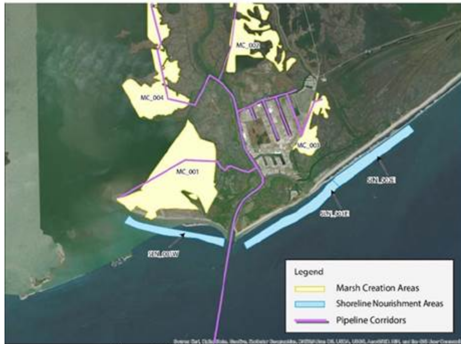
Figure 13-1: TSP Dredge Material Placement

Two options were evaluated for the offshore placement areas including Ocean Dredged Material Disposal Sites (ODMDS) and shoreline placement in the littoral zone. Below is a comparison of disposal cost for the two offshore disposal options, minus the ODMDS permitting cost. The ODMDS was determined to not be a viable option due to permitting cost and schedule restrictions.