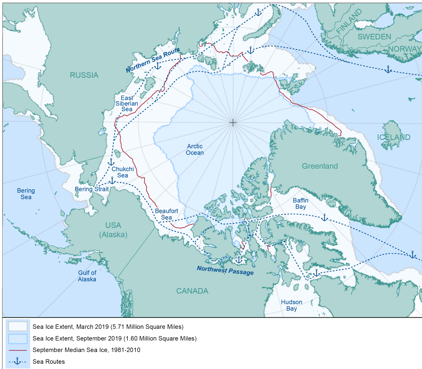
Figure 2: Trans-Arctic Maritime Routes and Arctic Sea Ice Extents from March and September 2019 Compared with the September Median, 1981 to 2010

as transporting natural resources extracted from the U.S. Arctic to the global marketplace.